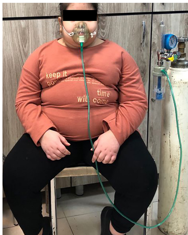
Figure 3: 8-years-old girl, diagnosed with ROHHAD syndrome

The most common type of neuroendocrine tumors seen in ROHHADNET syndrome are ganglioneuroma/ganglioneuroblastoma. 11 Our patient had a posterior mediastinal ganglioneuroma confirmed by histopathology. Two of the 4 cases reported from Iran also displayed the neuroendocrine tumor on imaging studies. This is