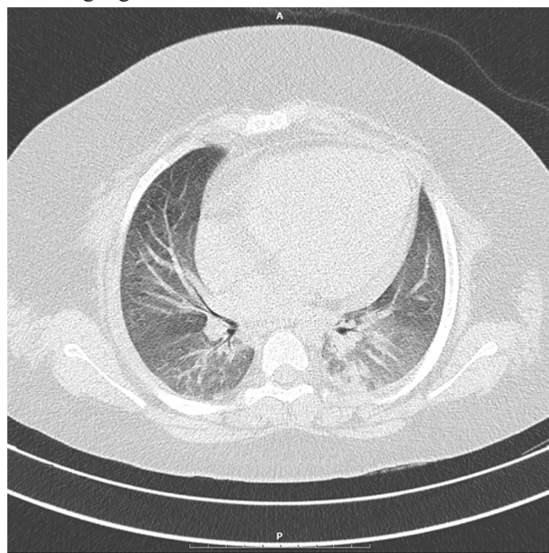
Figure 1: Bilateral subpleural ground-glass opacities and consolidation in left lower lobe in an 8-year-old girl with ROHHAD syndrome, suspected to be complicated by SARS-COVID-2 infection.

Seven days later, she underwent thoracotomy for the paravertebral mass that the pathology was in favor of a mature ganglioneuroma.