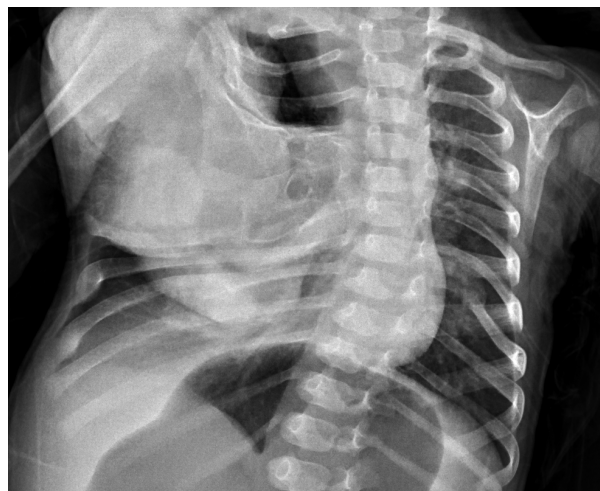
Figure 2: Chest-x-ray shows a large well-defined soft tissue mass in chest wall in right side with deformity of the adjacent ribs and mediastinal shift to the left.

Mesenchymal hamartoma can have variable manifestations depending on its size, from completely