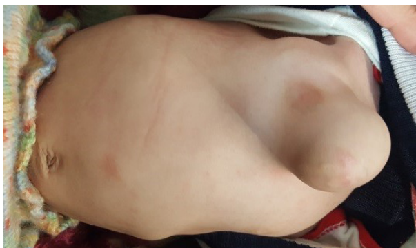
Figure 1: A large well-defined soft tissue mass in right side of the chest wall.

several hemorrhagic cysts with calcified matrix and ossified septa (figure 3A) without significant enhancement (figure 3B). The mass had both intra- and extrathoracic components originated from the fifth rib with compression on right pulmonary parenchyma, shifting the mediastinum to the left hemithorax, resulting in levoscoliosis and right hemithorax deformity. Another smaller chest wall mass with the same appearance medial to the eighth rib in the left side was also observed (figure 3C). The patient was scheduled for surgery. Extrathoracic component was removed and debulking of the intrathoracic remnants was proceeded. Histopathology was consistent with multiple hypercellular cartilaginous lobules admixed with benign spindle cell proliferation with a sharp interface alongside with multifocal endochondral ossification compatible with mesenchymal hamartoma. The infant had an uneventful course following surgery with no evidence of regrowth of the mass during six months of the follow up.