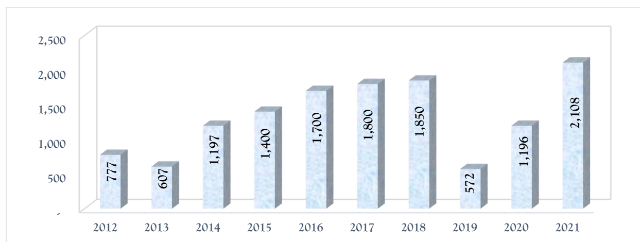
Figure 1. 10-year overview of IVIG consumption in Iran (Kg)

verged into more supply of local plasma for the PDMPs market and reached about 93% self-sufficiency rate of Immunoglobulins in 2021.