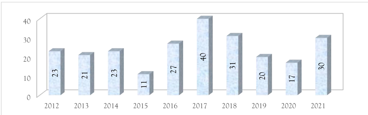
Figure 4. 10-year overview of Factor IX consumption in Iran (M IU)