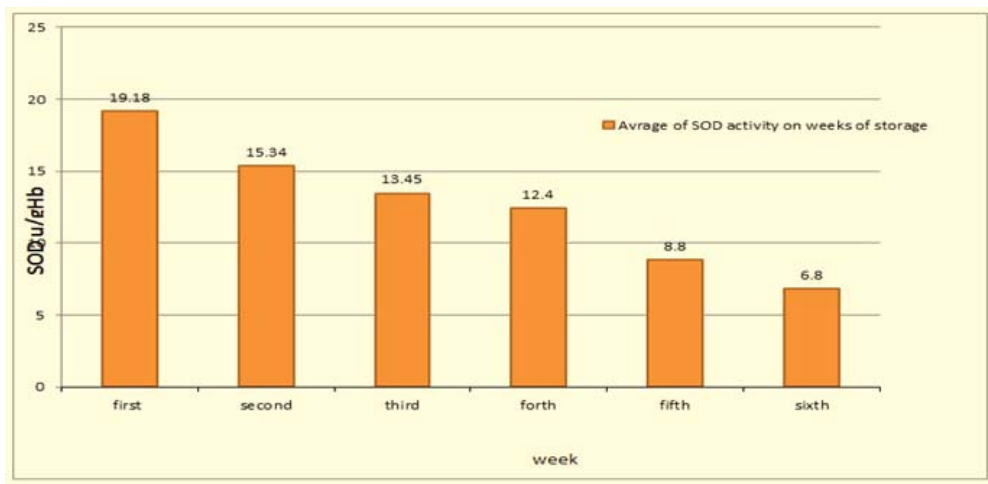
Figure 1: Super oxide dismutase activity in different weeks of blood storage.

deformability and unsatisfactory post transfusion in vivo survival. One of important changes that occur during storage is oxidative damage from free radicals that is due to imbalance between the production of reactive oxygen species and the efficiency of the antioxidant defense 21 . This is an important factor for RBC lesion that can affect an RBC quality during storage. Anti-oxidant system keeps free radicals at physiologically optimal levels and acts as an inhibitor of oxidation and deactivates free radicals 22,23 . SOD, CAT and GPX are three main enzymatic systems of the organism against free radicals and peroxides 12,24 .