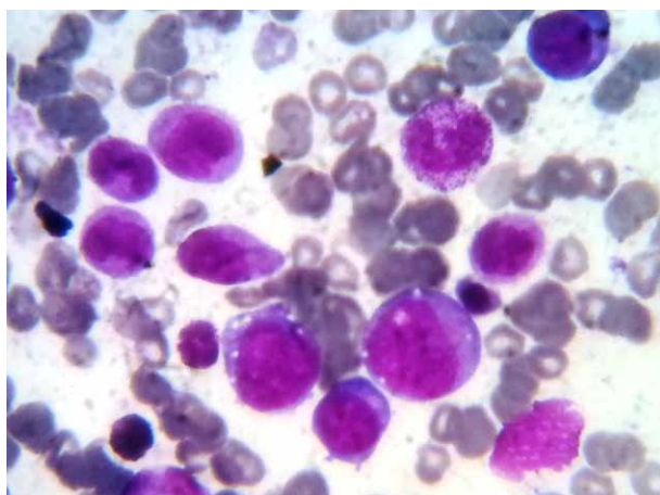
Figure 2: Persistently high leukocyte count revealing blast percentage of 9%.