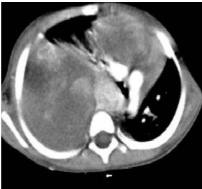
Figure 2: Contrast-enhanced computed tomography of the chest showing right upper mediastinal mass which was compressing the SVC and collateral vessels

Histologically, PNETs are characterized by a sheet of small round blue cells that react positively to glycoprotein CD99. Homer–Wright pseudorosettes are a characteristic histological finding in PNET 3-6 .