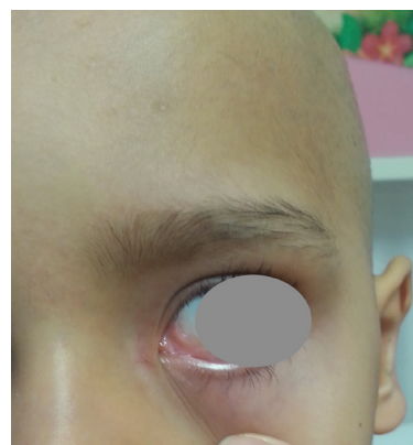
Figure 2: RMS after chemotherapy shows regression of the tumoral mass.