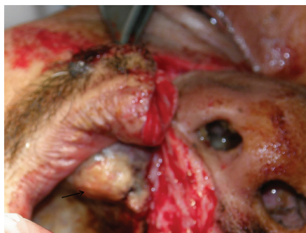
Figure 3: Excision of the mass in the right maxillary sinus by lateral rhinotomy approach

Sinonasal carcinosarcoma is a rare neoplasm characterised by complex histological pattern consisting of malignant epithelial and mesenchymal components. 1-4 This distinct combination of tissue components and low incidence of the tumor makes the diagnosis of carcinosarcoma a challenging entity. 5-7 This aggressive neoplasm is mainly seen among adults with average age of 60 years with male preponderance. 2, 6 Our patient was slightly younger than other reported patients. The proposed predisposing factors are smoking, alcohol consumption and history of previous irradiation. 2, 4, 5 The initial clinical features of sinonasal carcinosarcoma may mimic benign conditions like chronic sinusitis, sinonasal polyposis or allergic rhinitis. 1-3, 6 Grossly, these tumors are reddish friable polypoid masses with variegated appearance on cut surface and areas of necrosis and haemorrhage. 4, 5 Microscopically, the carcinomatous component is represented by in situ or an invasive squamous cell carcinoma. The sarcomatoid fraction of the tumor is arranged in storiform or whorled with interlacing bundles or fascicles. 5 The complex histological pattern and rarity of the carcinosarcoma may lead to incorrect diagnoses of spindle cell sarcoma, nodular fasciitis, malignant fibrous histiosarcoma, fibrosarcoma, synovial sarcoma