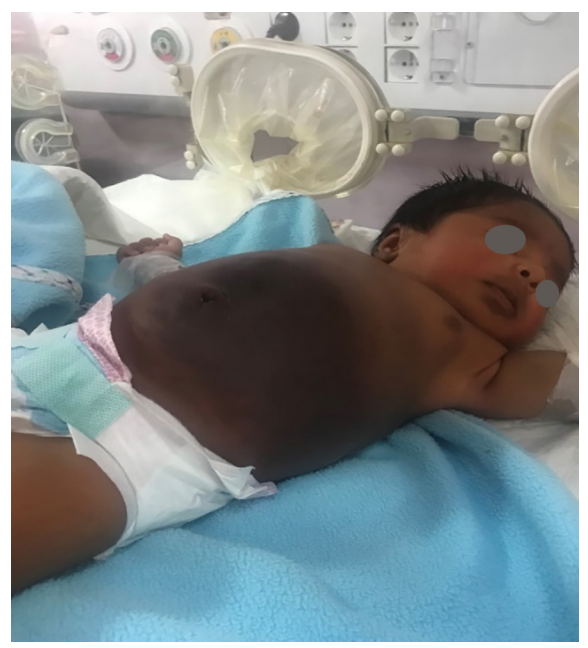
Figure 1: The extensive cutaneous purple to black lesion with ill-defined margins throughout the anterior abdominal wall musculature with invasion to subcutaneous tissues.

abnormalities. A skin punch biopsy of the lesion was performed on sixth week of life which was reported as "kaposiform Hemangioendothelioma" (Figure 2). Spiral CT angiography of abdomen showed a large