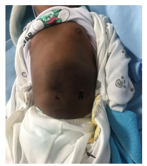
Figure 4: Significant regression of the cutaneous KHE after four weeks of treatment with vincristine and sirolimus.

enhancing mass in left side of the abdominal wall involving left oblique and transverse abdominis muscles along with transversalis fascia in medial aspect (Figure 3). Superior and inferior epigastric arteries in left side were enlarged and tortuous supplying the mentioned lesion. The abdominal aorta was normal. The treatment protocol was changed to oral sirolimus (0.8 mg/m<sup>2</sup>/dose, twice a day) and weekly injections of vincristine in addition to propranolol while the steroid was tapered off over 2 weeks.