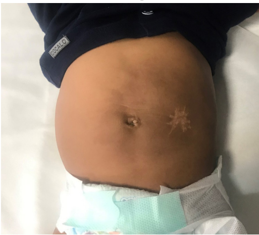
Figure 5: There was complete regression of the KHE without any induration with only discoloration of the skin on follow up after one year.

abdominal wall was replaced by subcutaneous fat without enhancement on last abdominal CT scan. There was no lesion or induration palpated clinically with only discoloration of the skin on follow up after one year (Figure 5).