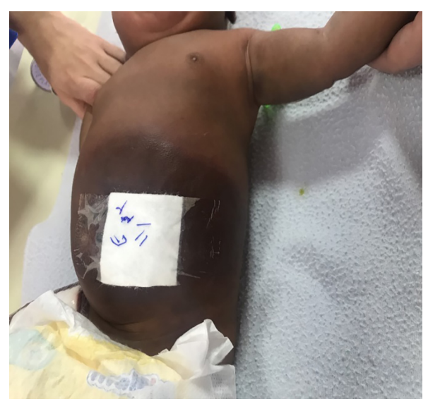
Figure 2: The vascular lesion of the abdominal wall after skin punch biopsy.