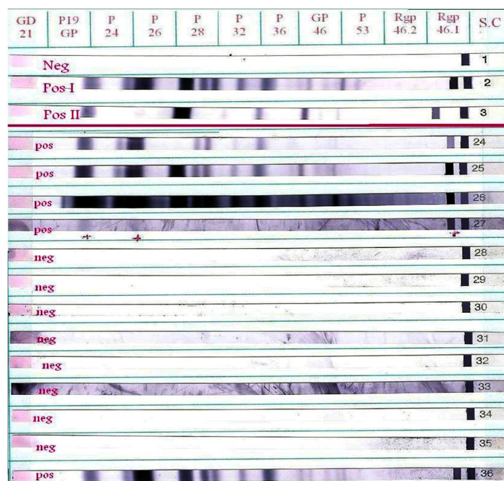
Figure 1. Results of Western blotting in thalassemic patients. Strip1: Negative control, Strip2: HTLV-I positive control, Strip3: HTLV-II positive control. Other strips: Tested sera. No reaction with HTLV specific proteins indicates seronegativity. Reaction with GAG (p19 with or without p24) and two ENV proteins (GD21 and rgp46-I) indicates HTLV-I seropositivity and reaction with GAG (p24 with or without p19) and two ENV (GD21 and rgp46-II) indicates HTLV-II seropositivity.

The human T-cell lymphotropic virus type I (HTLV-I) is the first retrovirus identified in humans. It has been responsible for a number of clinical syndromes, most notably adult T-cell leukemia or lymphoma (ATL). Understanding the epidemiology and clinical manifestations of this virus is necessary to properly diagnose and care for patients with HTLV-I infection. 1 There is no defined treatment for patients infected with HTLV-I, but the accurate knowledge of seroprevalence rates in different population groups may be helpful in establishing prophylactic measures to reduce rates of viral transmission from infected individuals. This infection is endemic in certain parts of the world as well as in a northern city of Iran, Mashhad. 10,11,13 A nation-wide sero-epidemiologic survey of adult T-cell leukemia virus (HTLV) has been performed in Japan. Sera from adult donors in 15 different locations were screened for anti-ATL. High incidences (6 to 37%) of antibody-positive donors