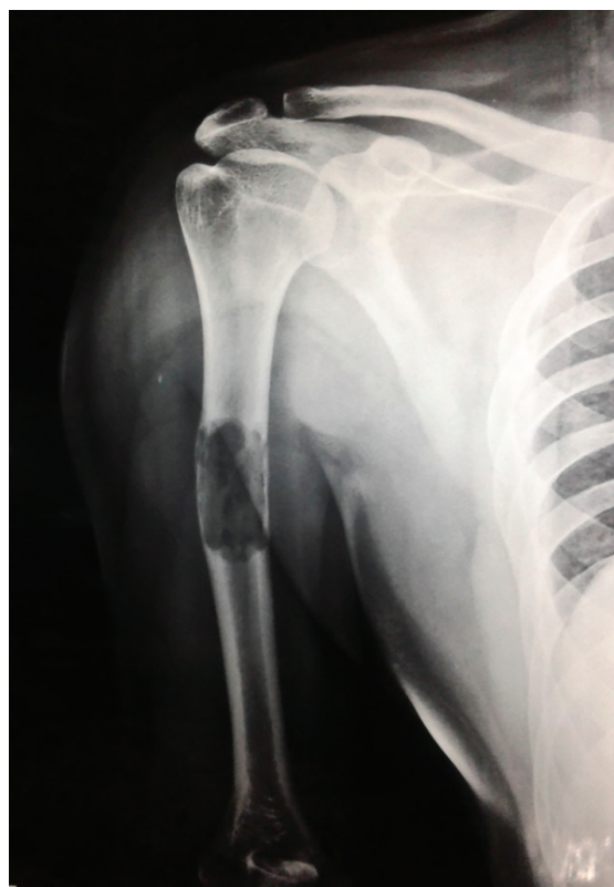
Figure 1: Radiograph of the humerus showing an extensive osteolytic lesion of the right humerus

myeloma develops in 65-84% of patients in 10 years in spite of radiation therapy and the median time to progression is 2-3 years. 3,4